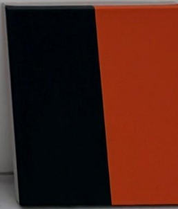
STEVEN AALDERS YELLOW GALLERY JUNE 2026 Leiden